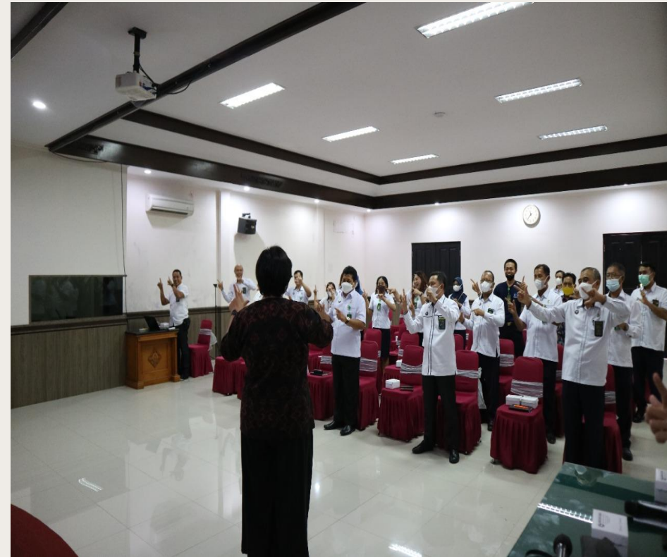
Pelatihan Petugas PTSP