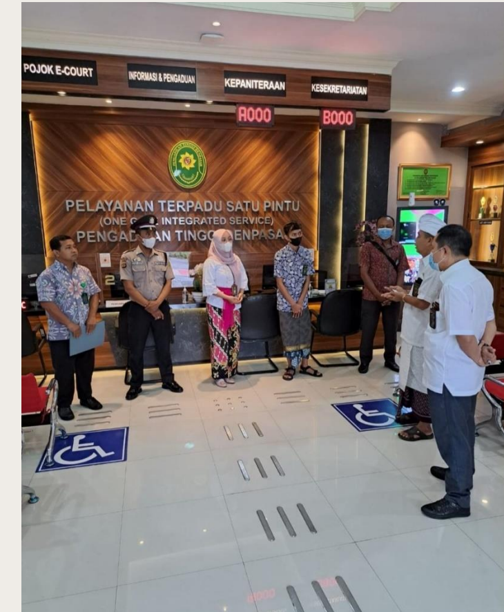
Pembinaan dan Pengawasan PTSP